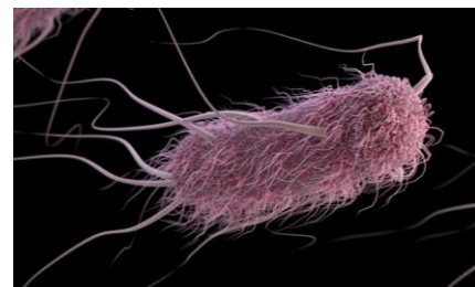
E. coli ( Escherichia coli ) (CDC Photo, 2016)

Escherichia coli is a gram-negative bacterium that is a part of the normal flora of the bowels. There are over one hundred different serotypes of E. coli , most of which do not cause human illness. Some strains of E. coli , such as O157:H7 and several other serotypes (e.g., O26, O111) contain genes that produce potent cytotoxins, called Shiga toxins, which give the bacteria the ability to attach to